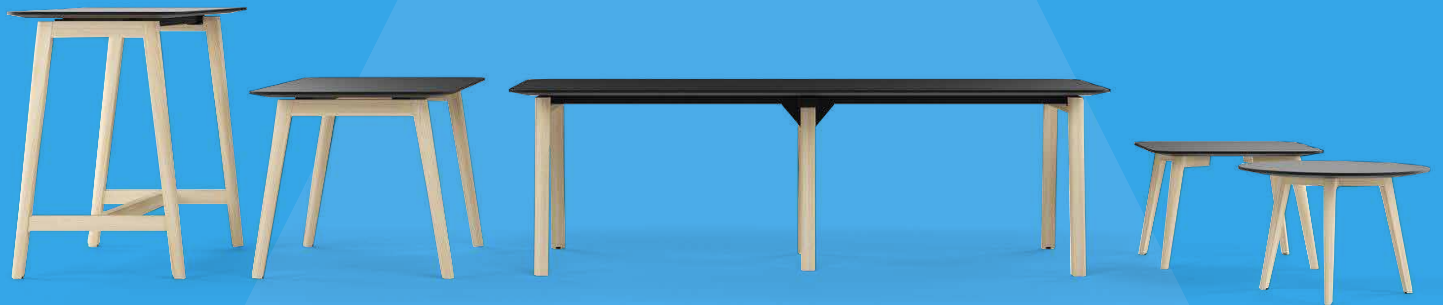
Nova Wood HPL table range