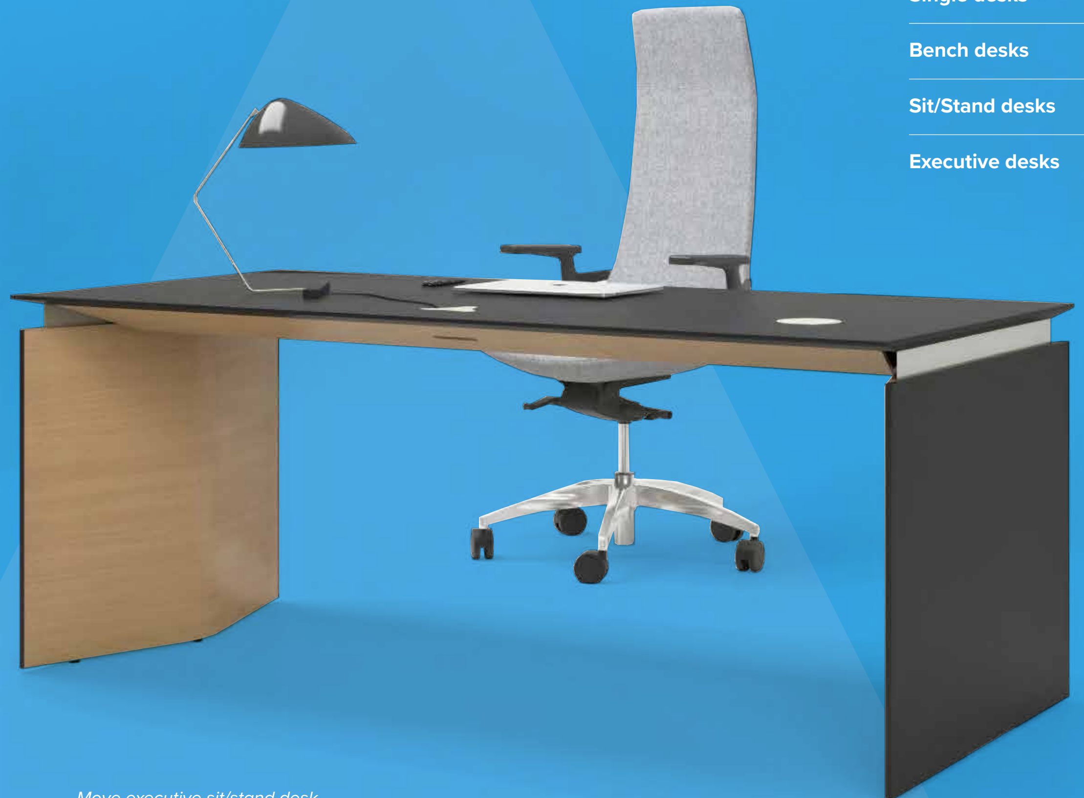
Move executive sit/stand desk