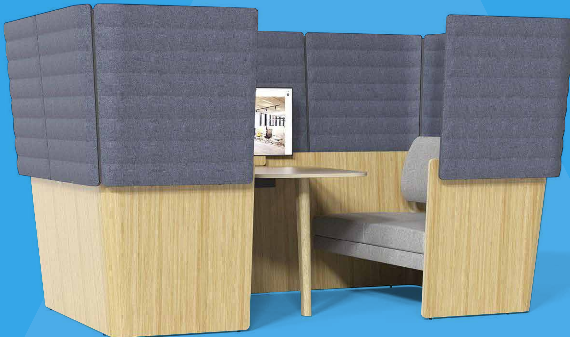
Arcipelago Wood meeting booth