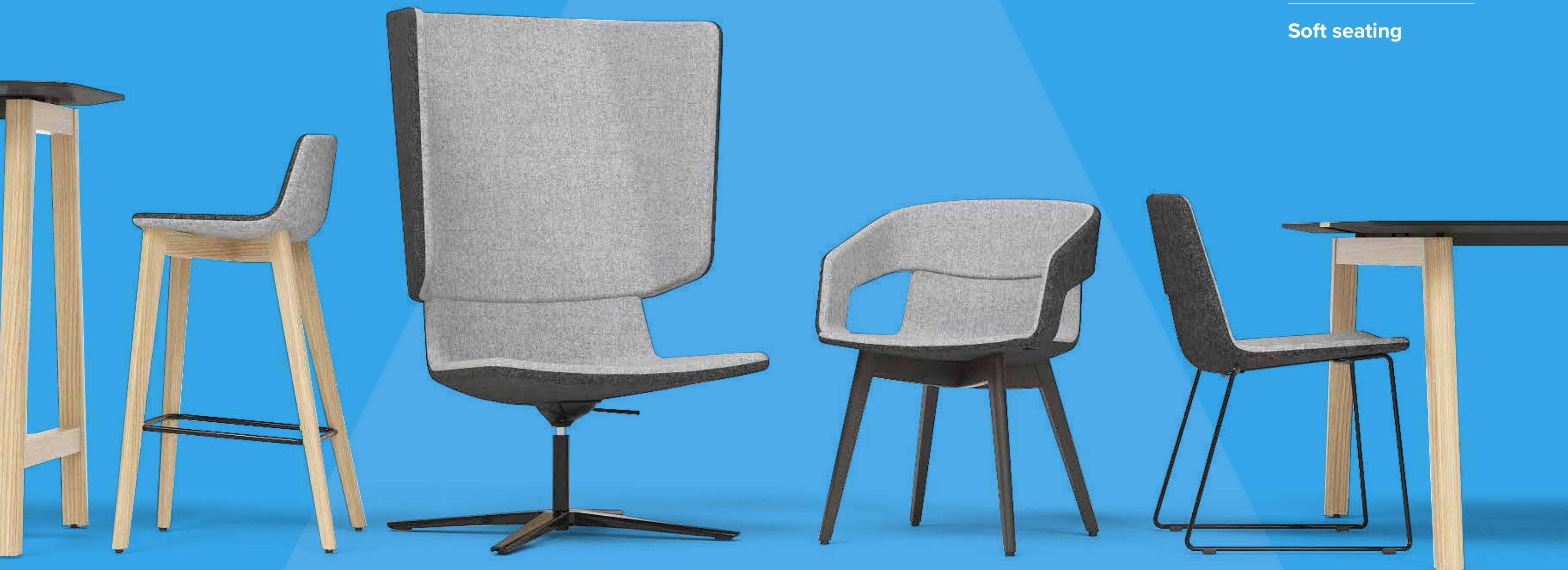
Tango seating range