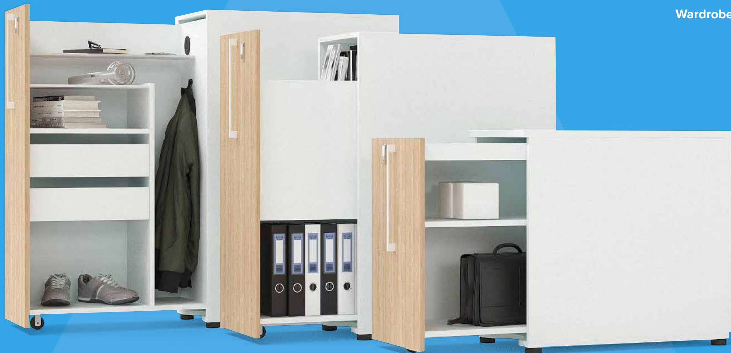
Boxi storage towers